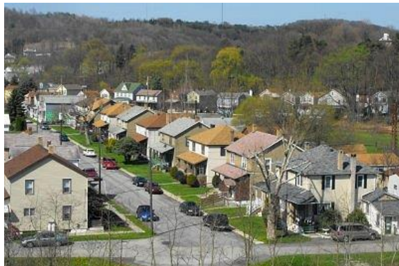
Eureka Mine No. 35 in Windber, Pennsylvania, mining operations in the early 1900s and former company houses in the 2000s.

The Wilmore Real Estate Company was primarily involved in the purchase, sale, and leasing of surface rights. They also managed all of the houses and farms that were rented or leased to Berwind-White's employees. The company also ran several of its own farms, including dairy farms and milk processing plants. Wilmore Real Estate was also involved in Berwind-White's reforestation program that began as early as the 1920s.