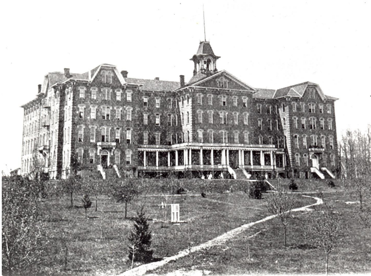
Earliest known photograph of the main building at Indiana State Normal School, ca. 1874-1875