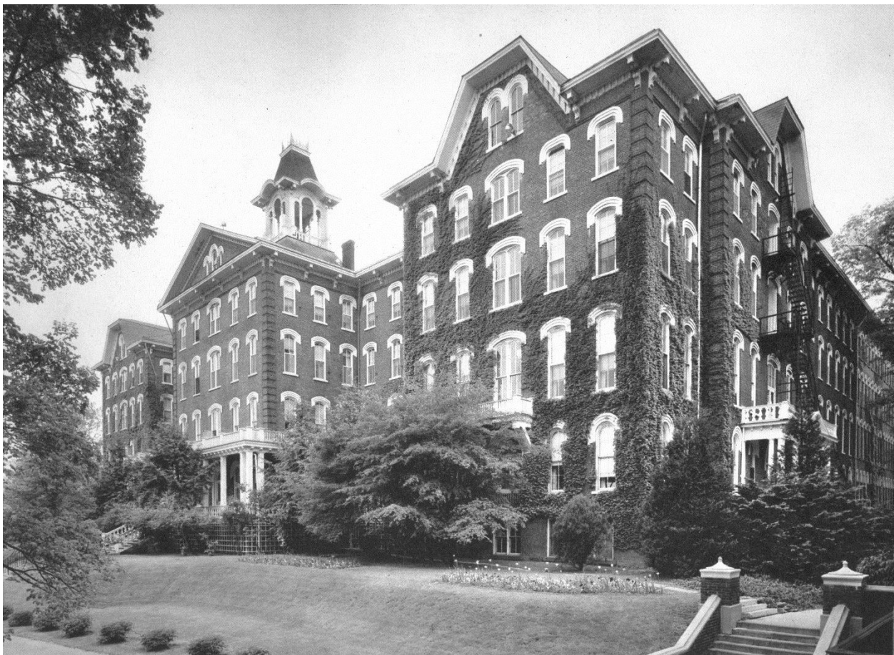
John Sutton Hall as it appeared in 1949