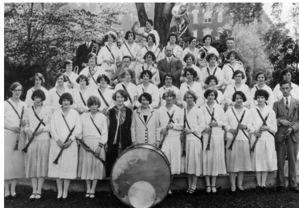
1907 Postcard of Thomas Sutton Hall and the newly built Conservatory of Music at Indiana State Normal School (ISNS); and the 1925 ISNS Band in front of John Sutton Hall.