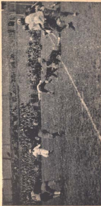
FOOTBALL AT INDIANA