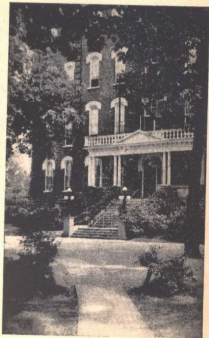
NORTH DOOR JOHN SUTTON HALL