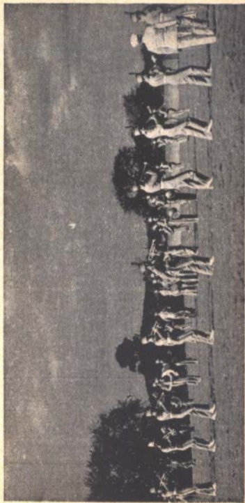
THE COLLEGE MARCHING BAND