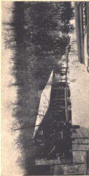
THE LODGE IN WINTER