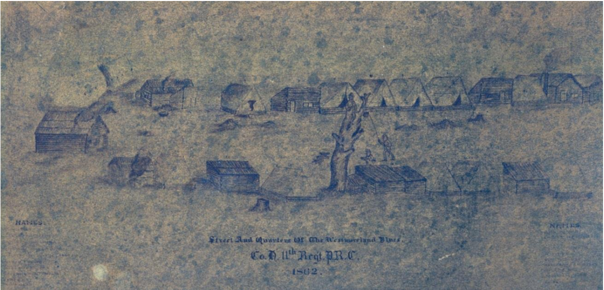
1862 Civil War ink drawing