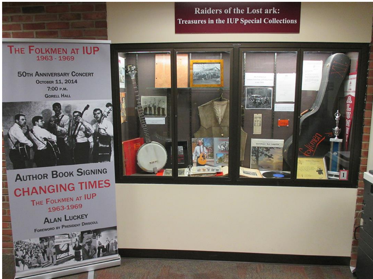
The Folkmen Collection on display in 2014 with instruments and memorabilia from the band

This collection was processed by Harrison Wick and the finding aid was updated on July 25, 2024.