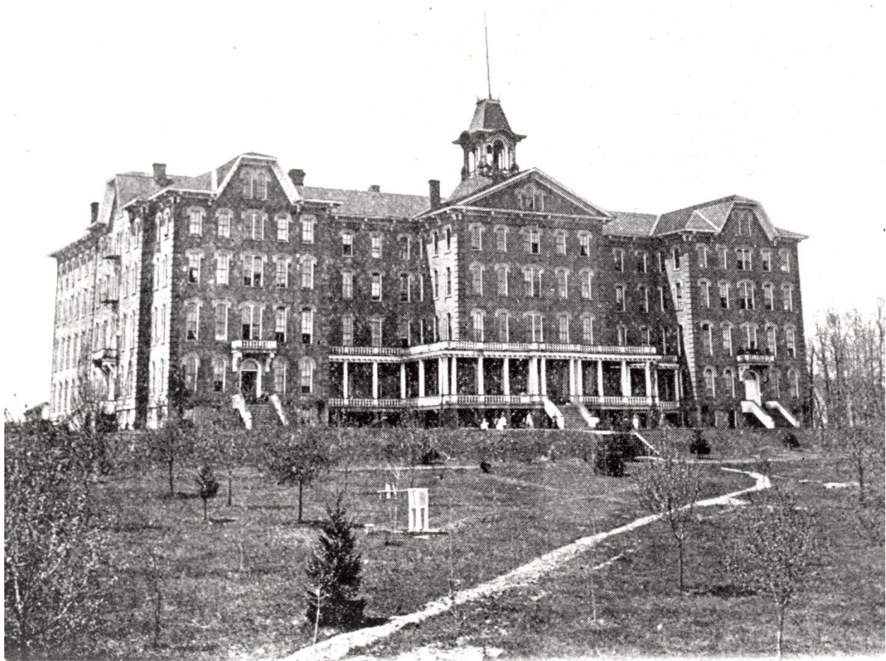
Earliest known photograph of the main building at Indiana State Normal School, ca. 1874-1875