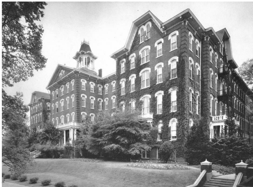
John Sutton Hall as it appeared in 1949