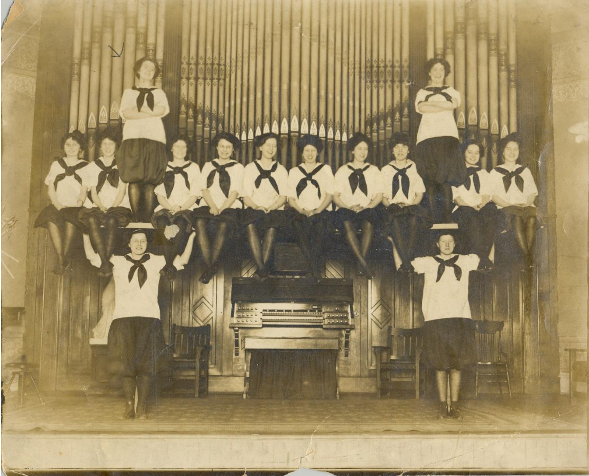
Campus organ in Thomas Sutton Hall, Indiana State Normal School, ( Record Group 53: Memorabilia and Ephemera Box 47 Folder 8)