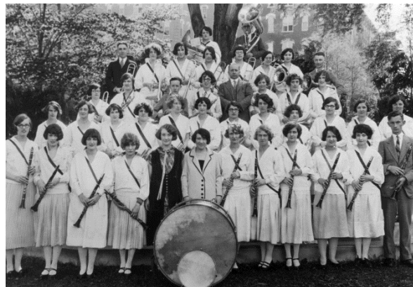
1907 Postcard of Thomas Sutton Hall and the newly built Conservatory of Music at Indiana State Normal School (ISNS); and the 1925 ISNS Band in front of John Sutton Hall.