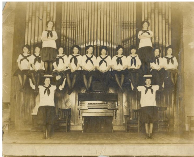
ISNS Postcard and Photograph from RG 53 Box 47 Folder 8 donated by the granddaughter of T. Grace Neville