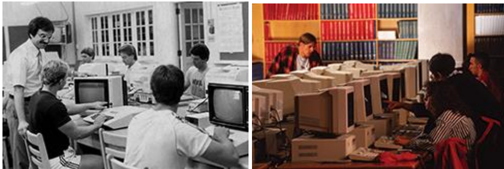
Computer Science classroom (1980s) and Computer Lab (1990s)