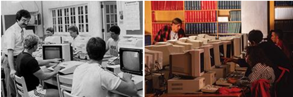
Computer Science classroom (1980s) and Computer Lab (1990s)